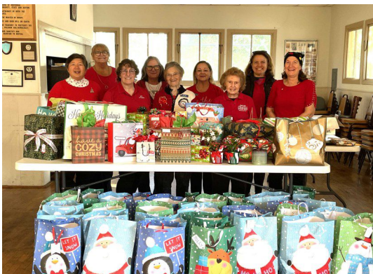
Members of Unit 238 Pacifica gathered for their holiday potluck dinner. The night included wrapping gifts for VA-Menlo Park resident patients and Pomeroy Recreation & Rehabilitation Center in San Francisco. Pomeroy offers support to those with developmental disabilities and those with traumatic brain injuries.