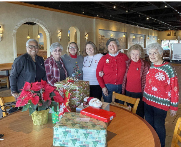
Unit 105 gathered for lunch, gift exchange and cheer. No talk of 'work.' Best wishes for a great 2025 for the Auxiliary.