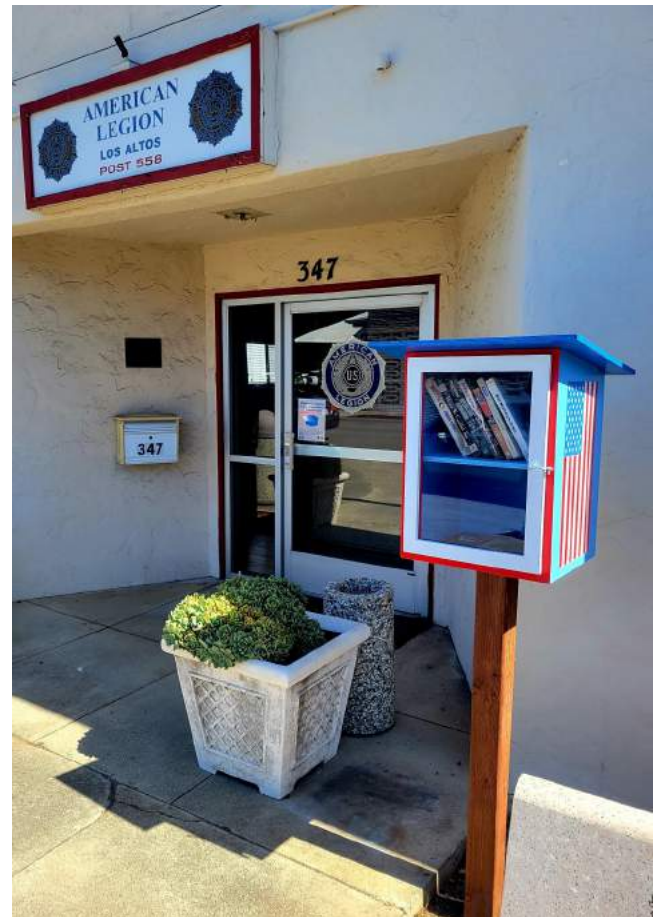
Los Altos Little Free Library

Since last September the Little Free Library installed in front of Los Altos Post 558 in District 13 has been going strong. We cleaned out our Post and homes and started putting books in the