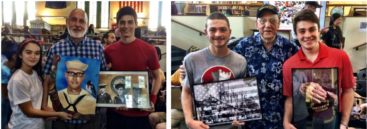
Veteran and student participants in the Living History Veterans Project.