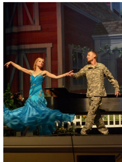
Participants in the 2015 National Veterans Creative Arts Festival.

The National Veterans Creative Arts Festival (NVCAF) is an annual celebration and grand finale stage and art show presented by the Department of Veterans Affairs and the American Legion Auxiliary. Local American Legion Auxiliary branches host talent competitions in visual art, creative writing, dance, drama, music, and more for Veterans receiving treatment in the Department of Veterans Affairs (VA) national healthcare system. Finalists from around the country are invited to take part in the NVCAF.