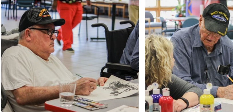
Participants in the Oklahoma Arts & Military Initiative program.

The Oklahoma Arts Council (OAC) began its Arts and Military Initiative as an effort to serve members of Oklahoma's military community, who make up nearly 10 percent of all residents in the state. In partnership with the Oklahoma Department of Veterans