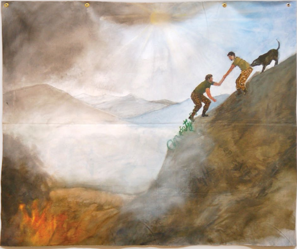
"Strength Deployed" Climbing from the dark From war and Through the thick We found the light The goals are Far at the top This mural represents our journey the mural, there are several painting that describe our depression, shame, fear appear on the canvas. You even beyond the horizon.

An Action Guide for Community Arts & Military Programming