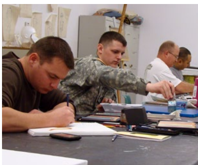
Participants in The Colorado Fine Arts Center's Military Healing Program.

The Fine Arts Center (FAC) has been offering Military Healing Programs for the Colorado Springs community since 2007. The programs are designed to educate the community about the power arts can have in the healing process through a variety of award-winning artistic courses for area Veterans and active-duty servicemembers and their families. Each year, work created in these courses is showcased in exhibits for the community. The FAC also provides military discounts for museums and theater as a Blue Star Program participant.